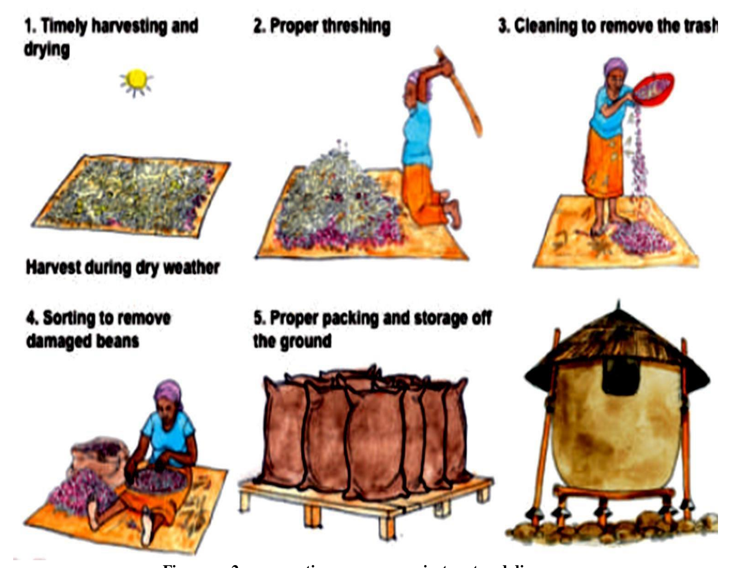
Figure no 2: preservative measures against pest and diseases

period), seedlings, cuttings or other plant material used is crucial for preventing pests and diseases, and to keep crop productivity.